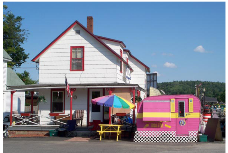
Food carts offer low start-up costs for any entrepreneur.