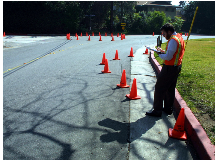
Temporary experiments can test physical improvements prior to implementation.

If included as part of a public charrette process, some examples of tactical urbanism may more quickly build trust amongst disparate interest groups and community leaders. Indeed, if the public is able to physically participate in the improvement of the city, no matter how small the effort, there is an increased likelihood of gaining public support for larger scale change later. Additionally, involving the public in the physical testing of ideas can yield unique insights into the expectations of future users and the types of design features for which they yearn; truly participatory planning must go beyond drawing on flip charts and maps.