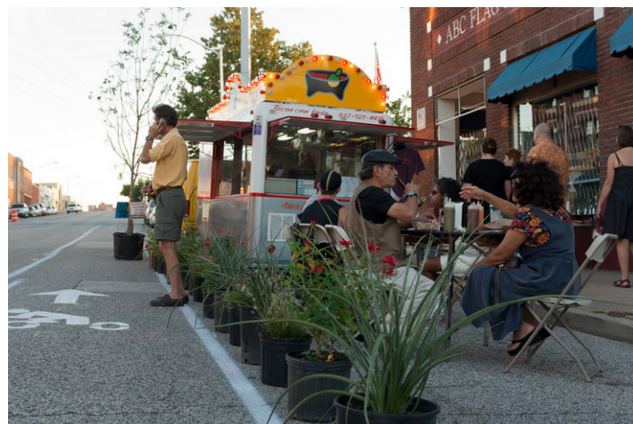
Fort Worth, TX Build a Better Block.

country. Indeed, similar efforts have now taken place in Fort Worth, TX, Oyster Bay, NY, Oklahoma City, OK, and Memphis, TN where 15,000 participants helped reinvigorate a stretch of Broad Avenue.