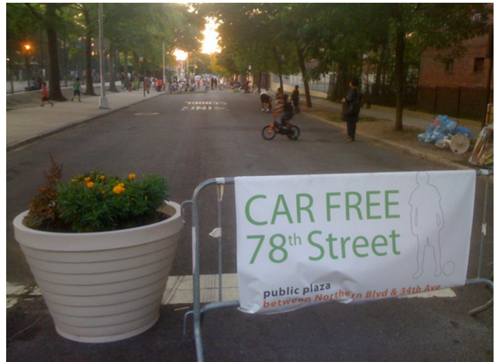
Car free space provides carefree play space.