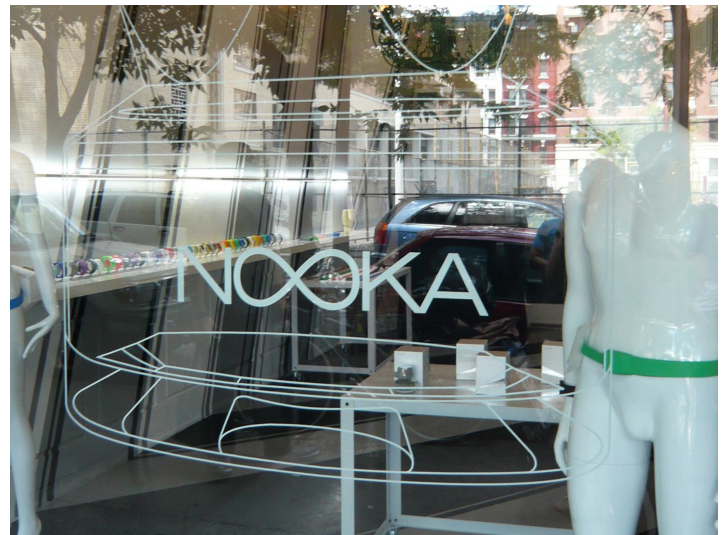
A Pop-Up Shop, Credit: Limite Magazine