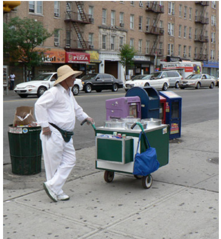
A New York City Street Vendor

According to Shinohara, vendors play a key role in animating the various spaces of a city. This “Custom Bike Urbanism [...]” suggests a possibility of constructing urban spaces that are individualistic and dispersed, yet able to accommodate a multitude of dynamic forms. With the inherent characteristics of mobility and ephemerality, it brings vibrancy to redundant urban space and enhances the function of the existing city.”