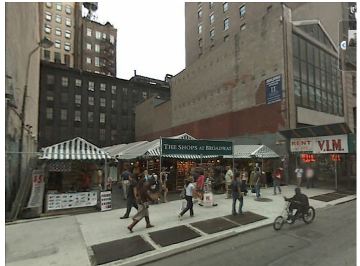
Pop-up tent-based retail helps activate this vacant lot.

More than just marketing ploys for large retail corporations, pop-up stores genuinely bring vitality and help businesses transition to permanent spaces.