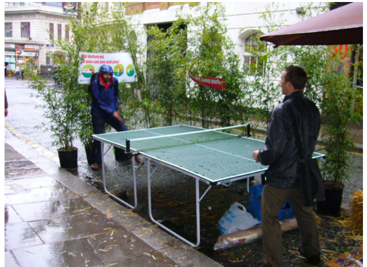
Rain or shine, PARK(ing) Day brings creativity to city streets.

While participating individuals and organizations operate independently, they do follow a set of established guidelines. Newcomers can pick up the PARK(ing) Day Manifesto , which covers the basic principles and includes a how-to implementation guide.