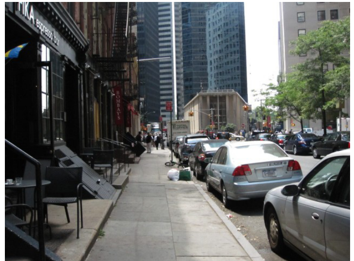
A narrow sidewalk limits the possibility of outdoor seating.

In city's with a short supply of space and a need for more publicly accessible seating, pop-up café's are fast becoming a valued addition to the public realm. If successful, they can also prove the need for permanently expanding city sidewalks.