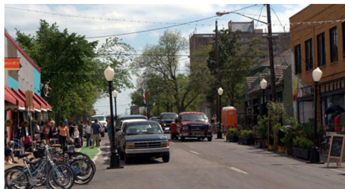
Before and after: Dallas Build a Better Block