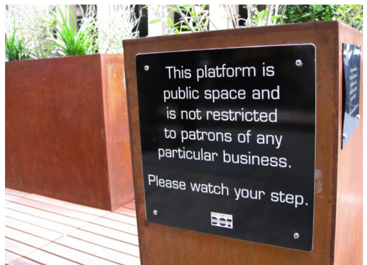
New York City now sanctions what used to be done by advocates.