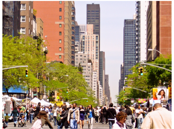
One of New York City's many street fairs.

Street Fairs are the type of event where people become familiar with each others skills and learn what their community has to offer. Often, street fairs take place within a community's main street, or at larger sites, such as the village green or a centrally located plaza. This can raise the visibility of the city's premier public space and offer entertainment to citizens of all ages: many well-programmed street fairs feature musical performances, art exhibitions, interactive entertainment, and local food vendors. Street fairs can also provide the opportunity for communities to organize political support for local improvement initiatives.