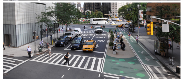
NYC's Greenlight for Broadway provides more space for people.