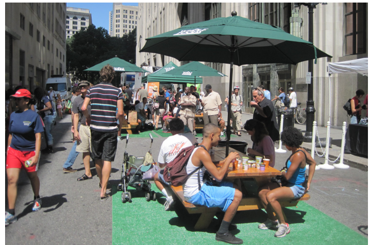
Street fairs help bring communities together in the public realm.