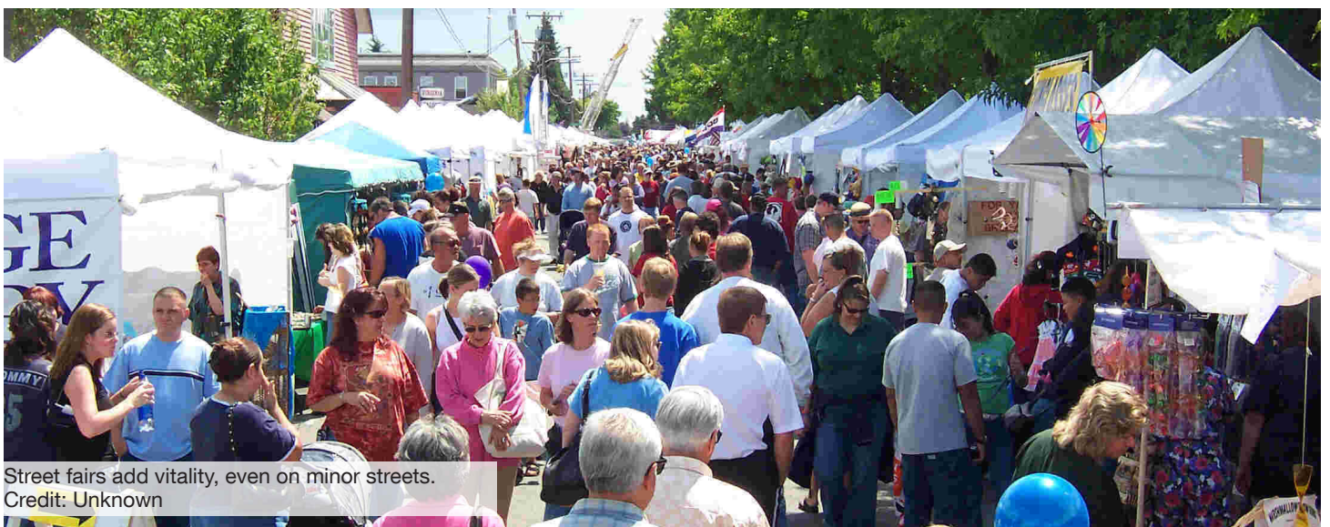
Street fairs add vitality, even on minor streets.