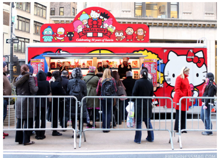
A Pop-Up Shop