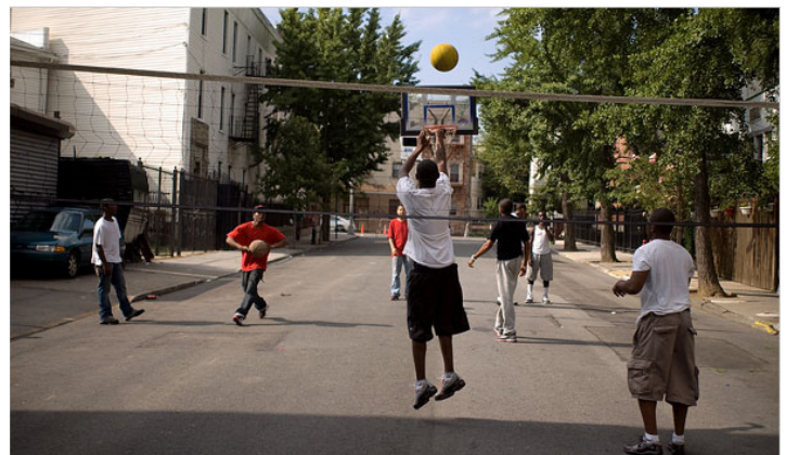
Play streets provide playgrounds where they don't currently exist.