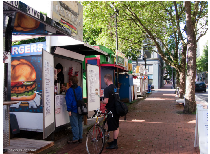
Food carts in Portland, OR

From Los Angeles to Miami, smart cities not only lower the barriers to entry, but also nurture such businesses, as they they contribute to the city's local economy and enhance its sense of place.