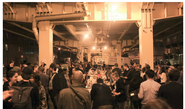
A group of non-profit and neighborhood organizations hosted a 2011 PARK(ing) Day after party below the Brooklyn-Queens Expressway.