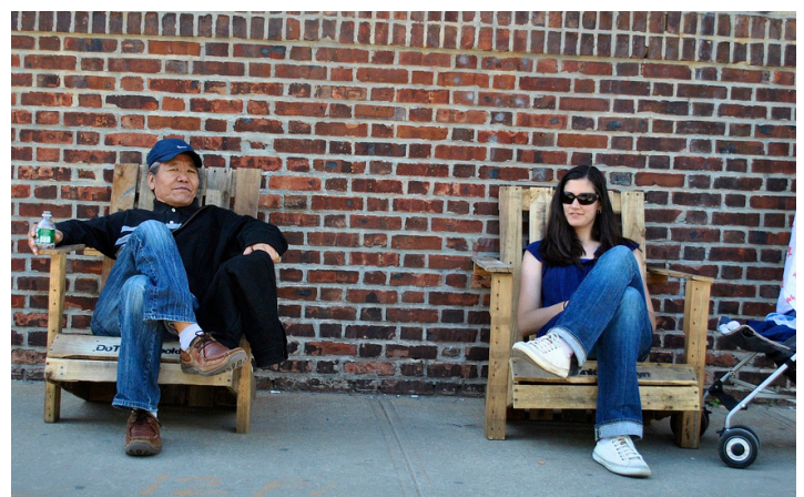
Step 3: Place chairs where needed.