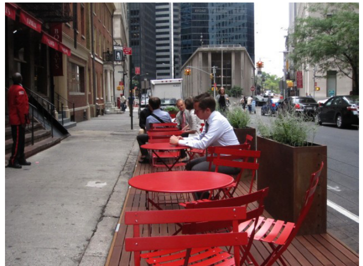
Trading parking space for outdoor seating that can be used by restaurant patrons or passersby is a win-win.