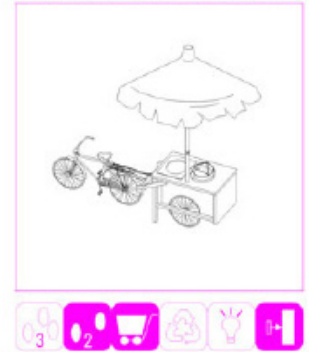
Above and below: Mobile vending continues to increase in popularity.