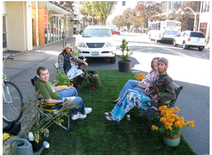
A simple PARK(ing) Day installation.