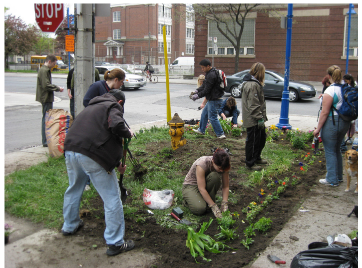
Green Guerillas at work.