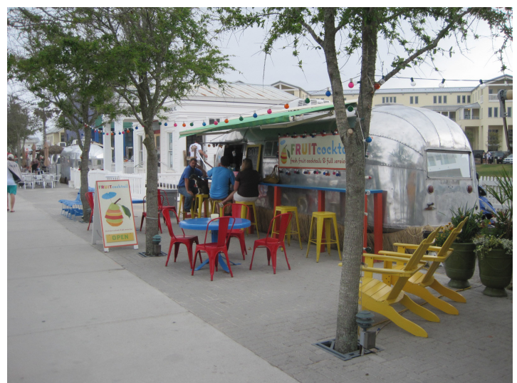
Food carts line Seaside, FL's central square.