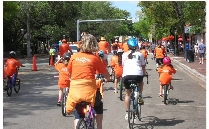
Bike Miami Days