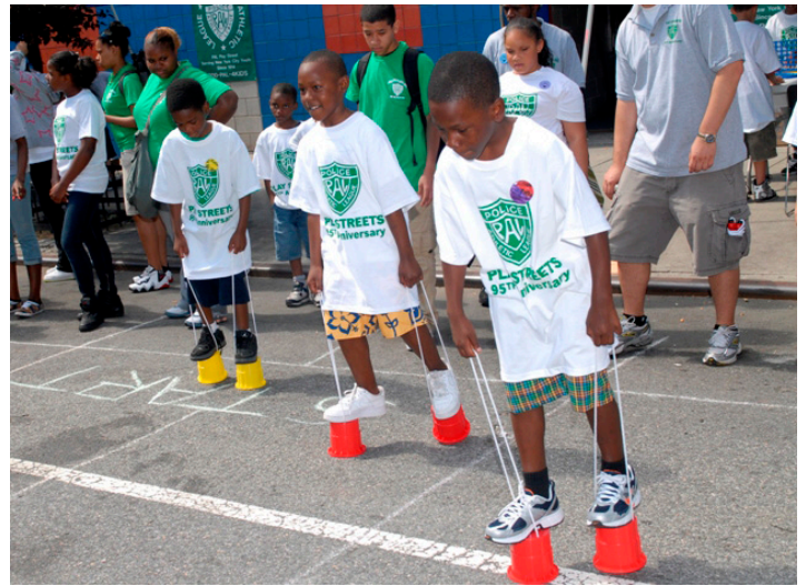
Play streets give kids space to move.

In New York City, a 'play street' is made possible when 51% of the residents living on a one-way residential block sign a petition and offer it to their local police and transportation officials, who then send it to the local community board for review. Once the community board approves the idea, the initiative can take shape and the city provides youth workers to supervise the program. Approximately 75% of these initiatives are organized by the New York City Police Athletic League.