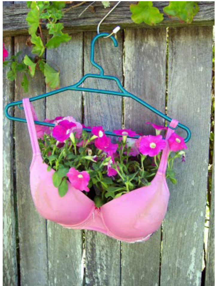
Guerilla Gardening offers an outlet for creative energy.

Guerilla gardening is an excellent tactic for instantly improve an urban neighborhood. Often times, gardens are cared for years after they are first created, illegally. Indeed, the first garden started in a vacant New York City lot by the Green Guerilla's became so loved that it is now maintained by volunteers and the New York City Parks Department. This exemplifies how tactical urbanism is intended to work.