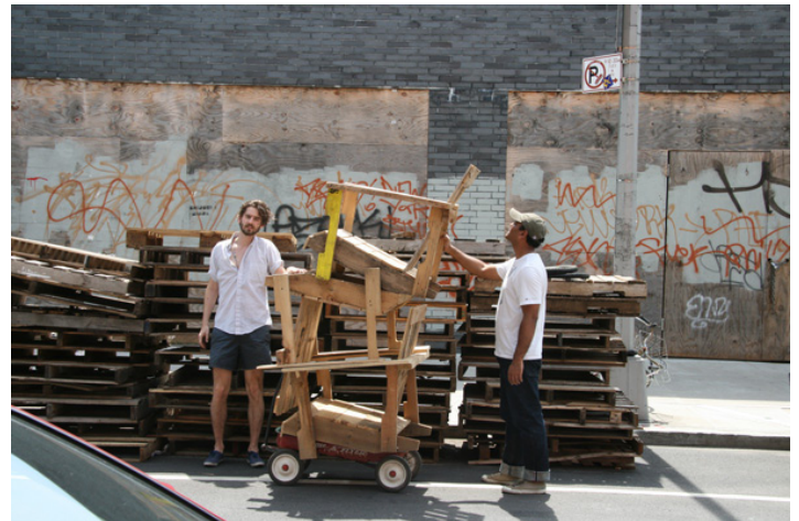
Step 1: Collect used shipping pallets.

Whether to rest, socialize, or to simply watch the world go by, increasing the supply of seating almost always makes a street, and by extension, a neighborhood, more livable.