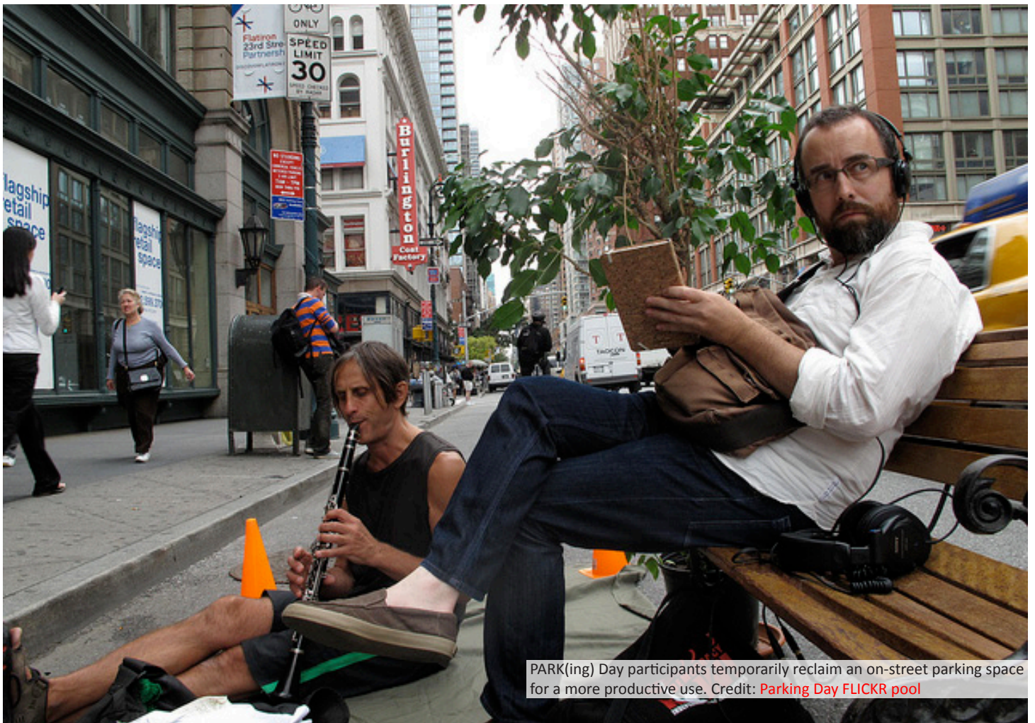
PARK(ing) Day participants temporarily reclaim an on-street parking space for a more productive use.