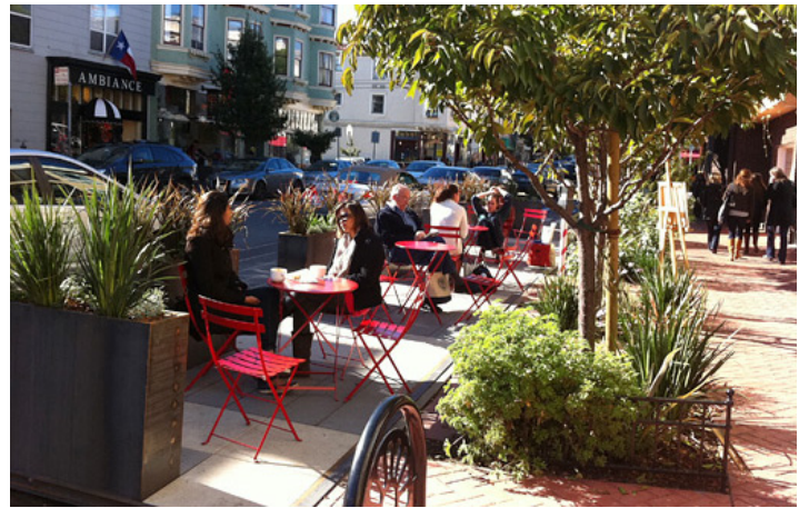
San Francisco's Pavement to Parks.