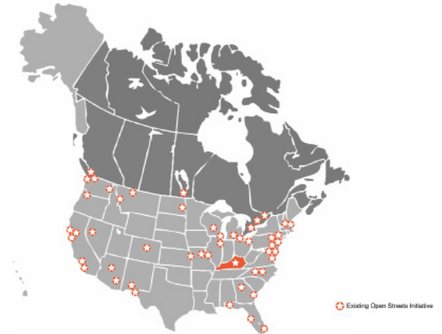
North America’s Open Streets Initiatives.