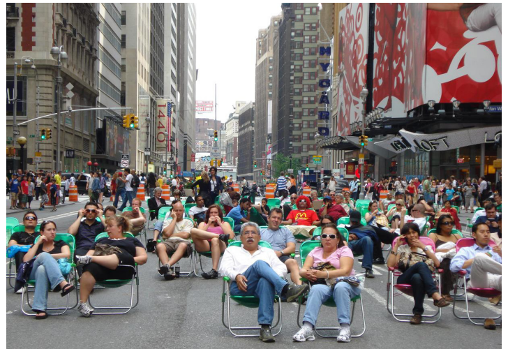
Phase 1 of the new Times Square simply added lawnchairs.

By taking this experimental, "lighter, quicker, cheaper," approach, the City and public-at-large are able to test the performance of each new plaza without using up scarce public resources. If successful, the intervention can then transition into a more permanent design and construction phase, as is happening currently in several of New York City's new plazas and sustainable street "pilot" projects.