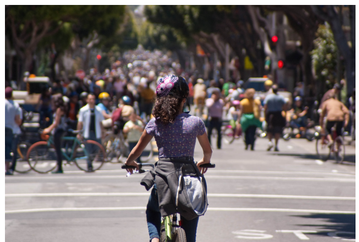
San Francisco’s Sunday Streets